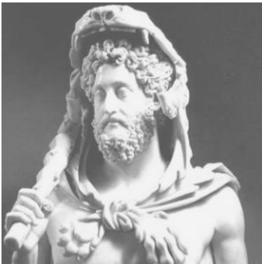
Commodus as Hercules (2 nd century AD)

"Men of ancient times have handed down ... two different conceptions: Certain of the gods, they say, are eternal and imperishable, such as the sun and moon and the other stars of the heavens... But the other gods, we are told, were terrestrial beings who attained to immortal honour and fame because of their benefactions to mankind, such as Heracles, Dionysus, Aristaeus, and the others who were like them." ~ Diodorus